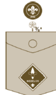
LEFT POCKET, NAVY BLUE OR TAN SHIRT