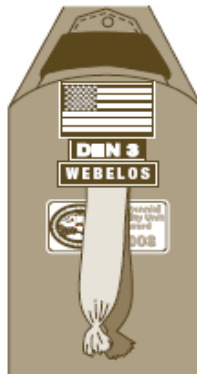
WITH DEN EMBLEM