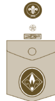
LEFT POCKET, (TAN SHIRT)