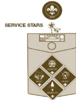
LEFT POCKET, NAVY BLUE OR TAN SHIRT