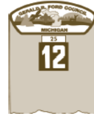
OPTIONS FOR LEFT SLEEVE