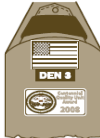
WITH DEN NUMERAL